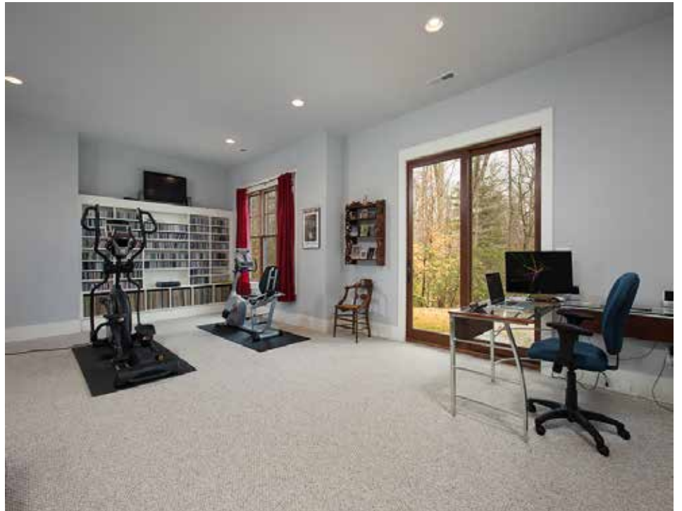
Mud room, patio area, master bath, bonus room