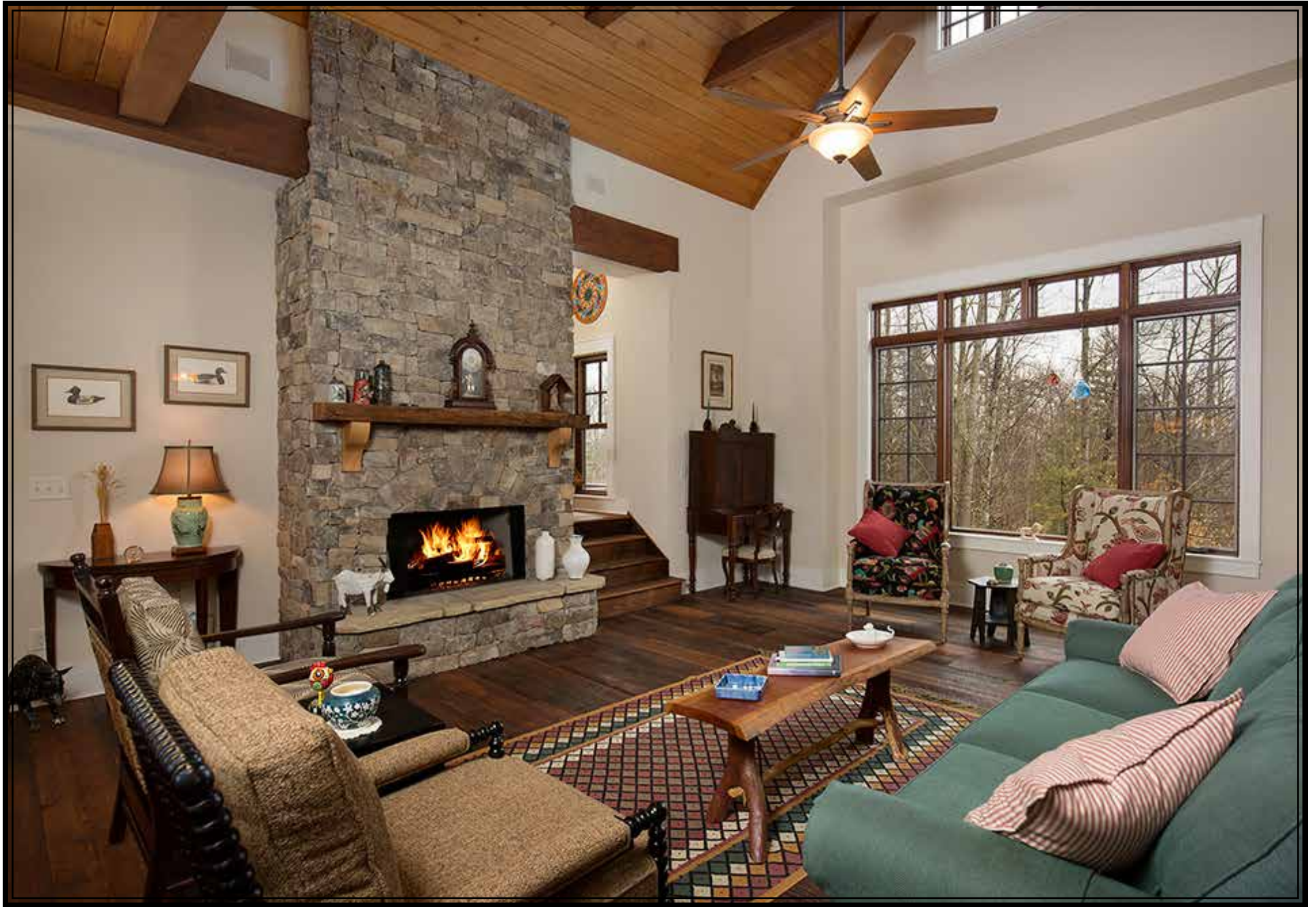
Great room, cathedral ceiling, gas fire