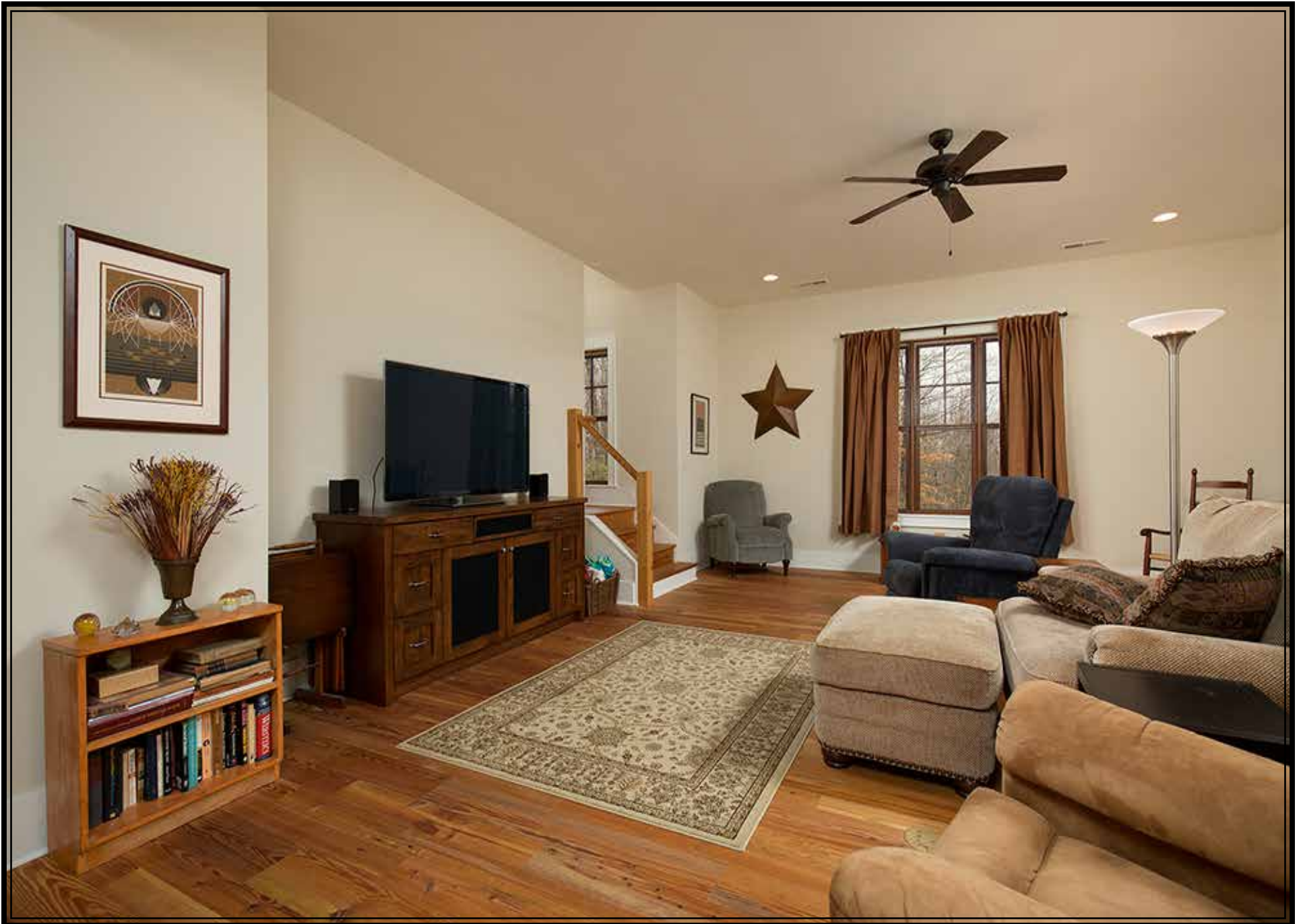
Lower level family room 10 foot ceilings Heart of Pine floor