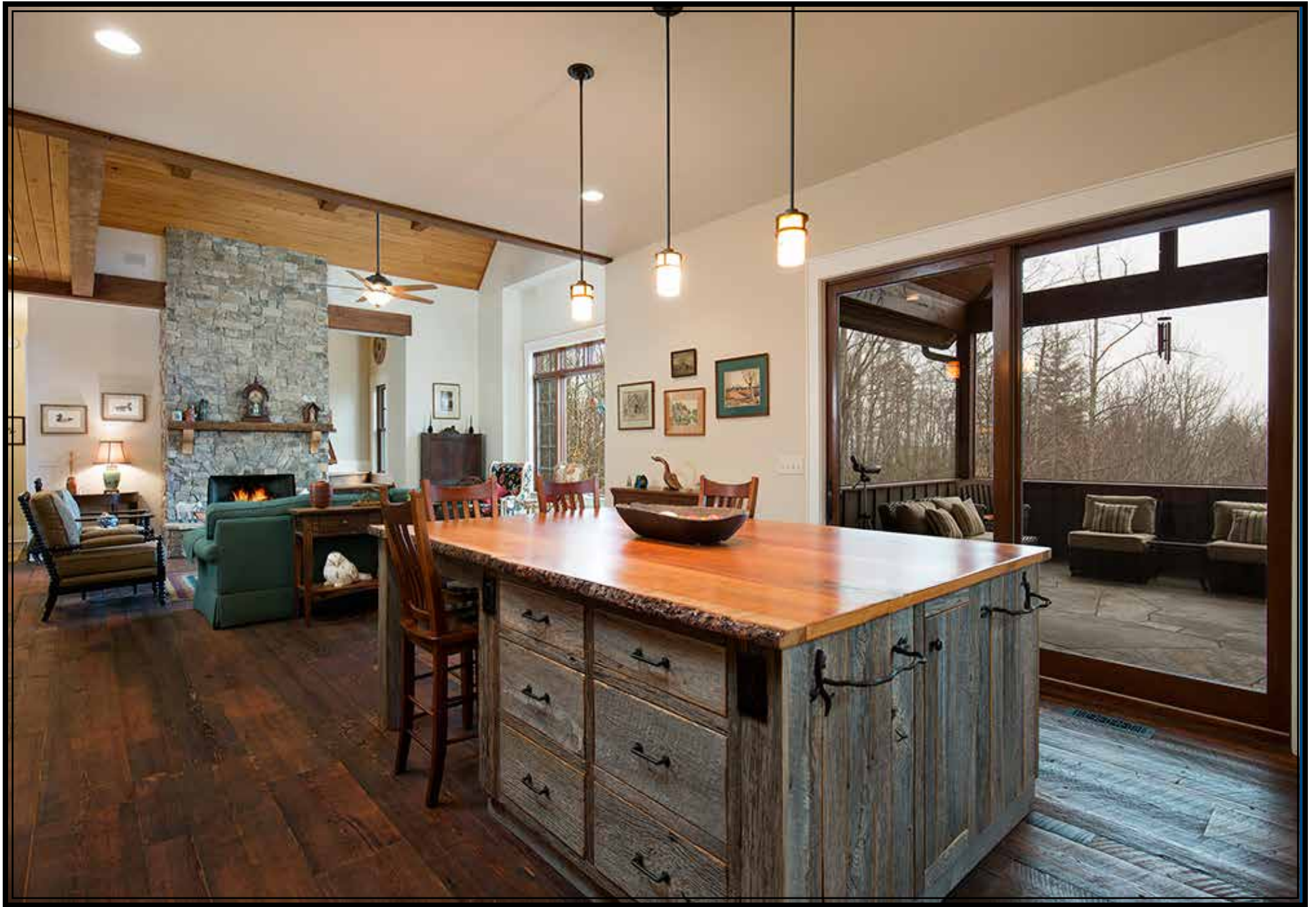
Beautiful Custom barn wood cabinet with Cherry top