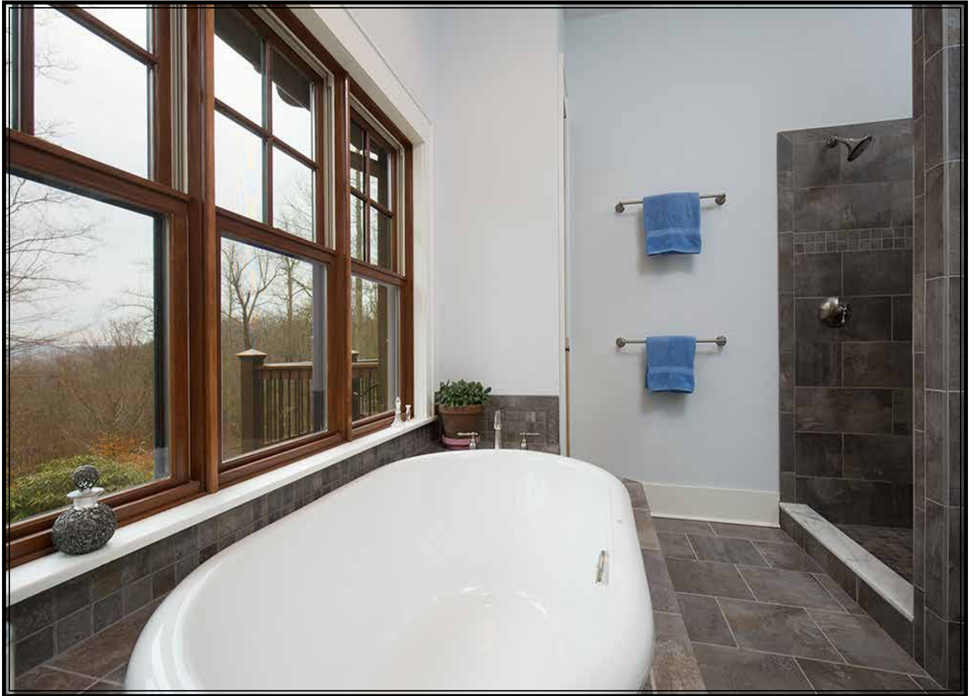
Master Bath, view, soaking tub, large walk-in shower