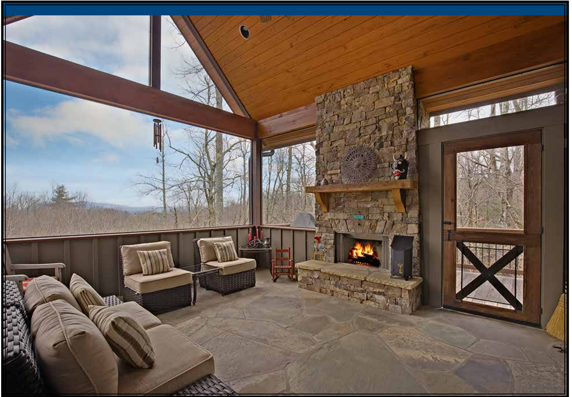
Screen Porch rock floor, wood burning fire, vaulted ceiling