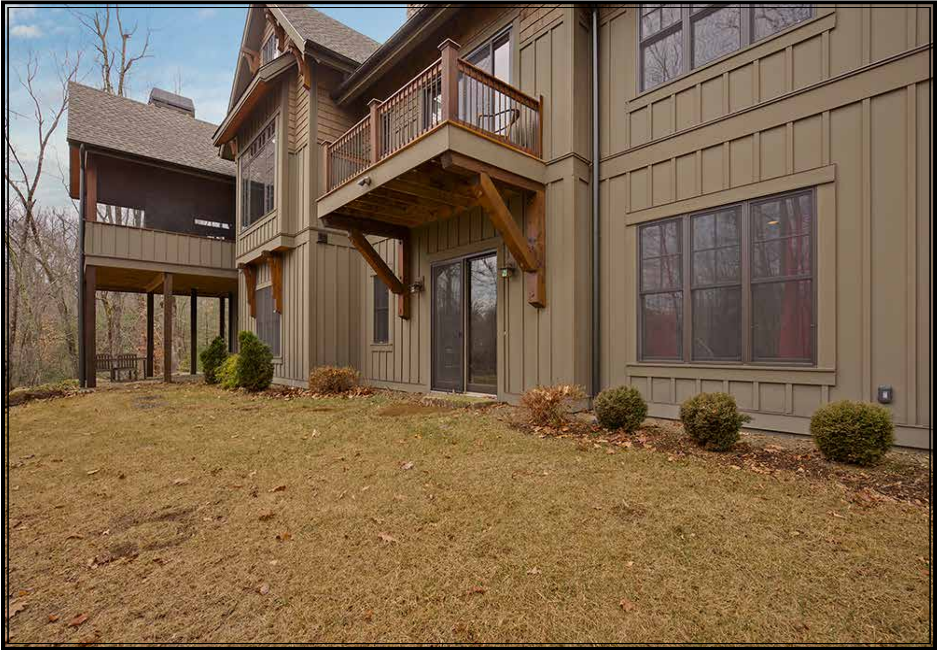
Back yard, master bedroom deck, patio area