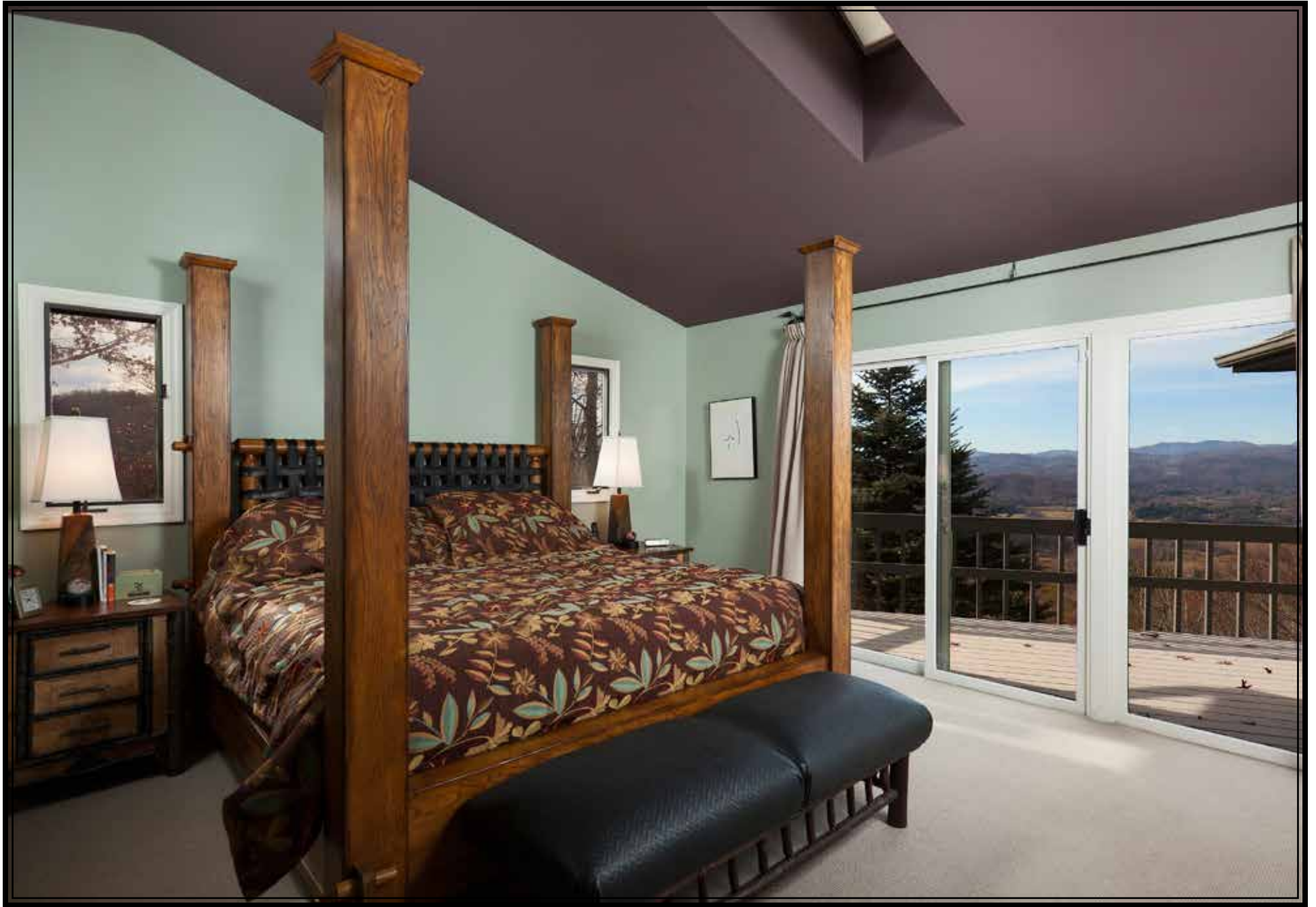
Amazing views From Master Bedroom