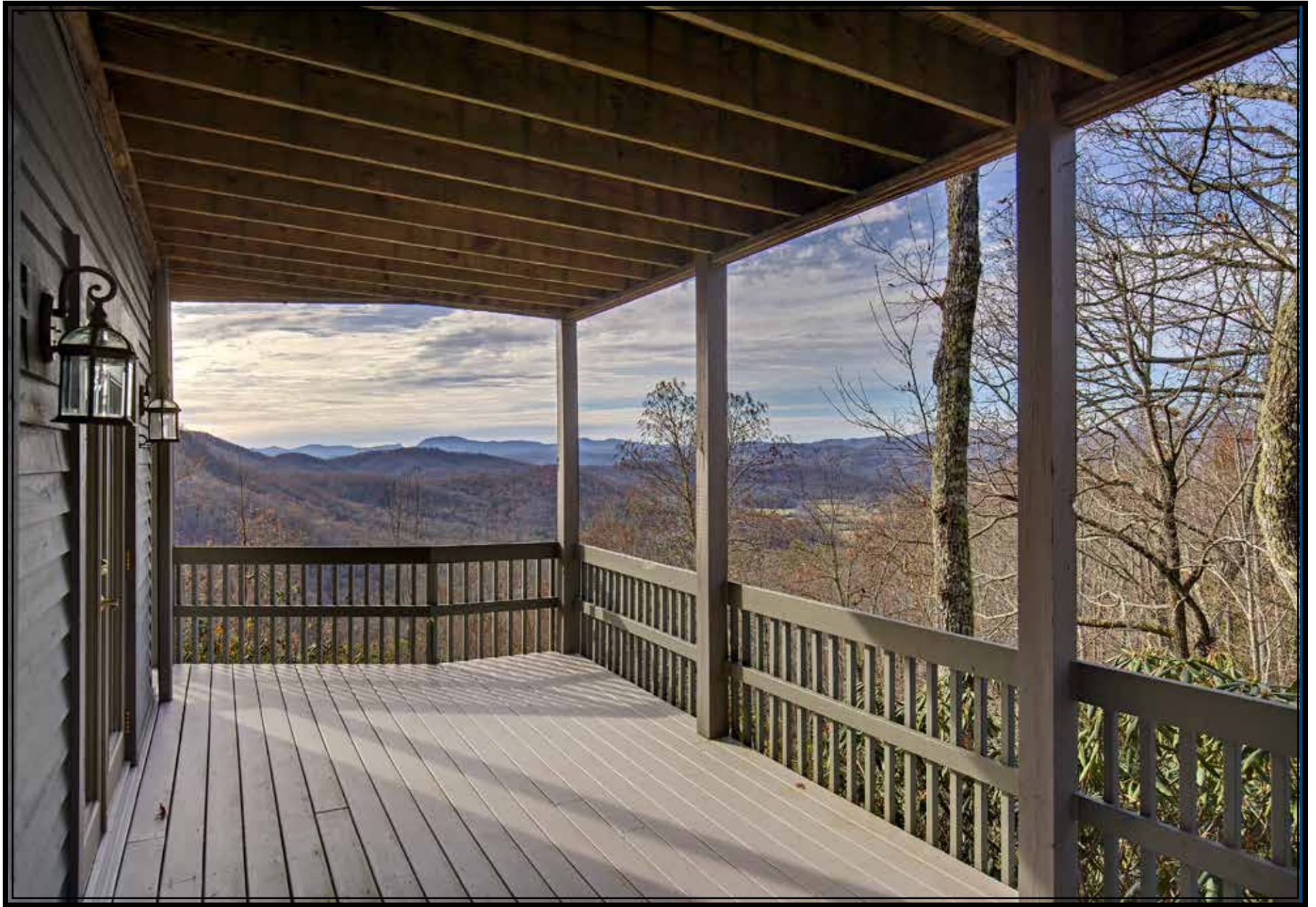
Wrap around Porch